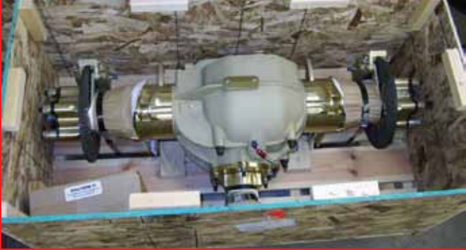
Every thing uniquely made