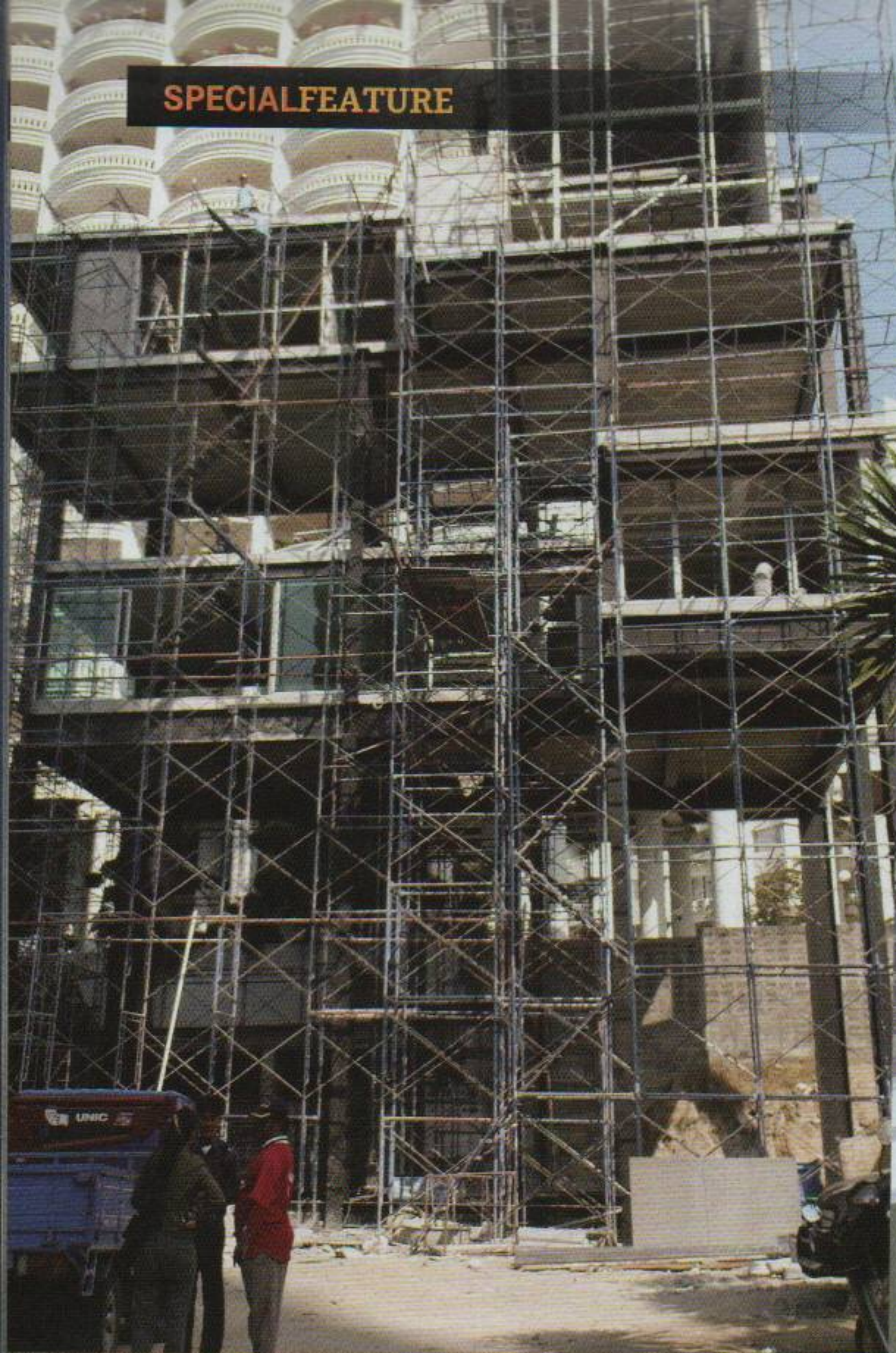
Left column: The real life 10-storey showroom for W-Tower under construction at Wong-amat with two interiors designs shown below. This picture and right column shows designs for the On The Hill Condominium at Pratamnak.