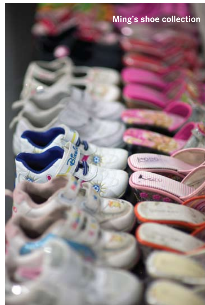
Ming's shoe collection