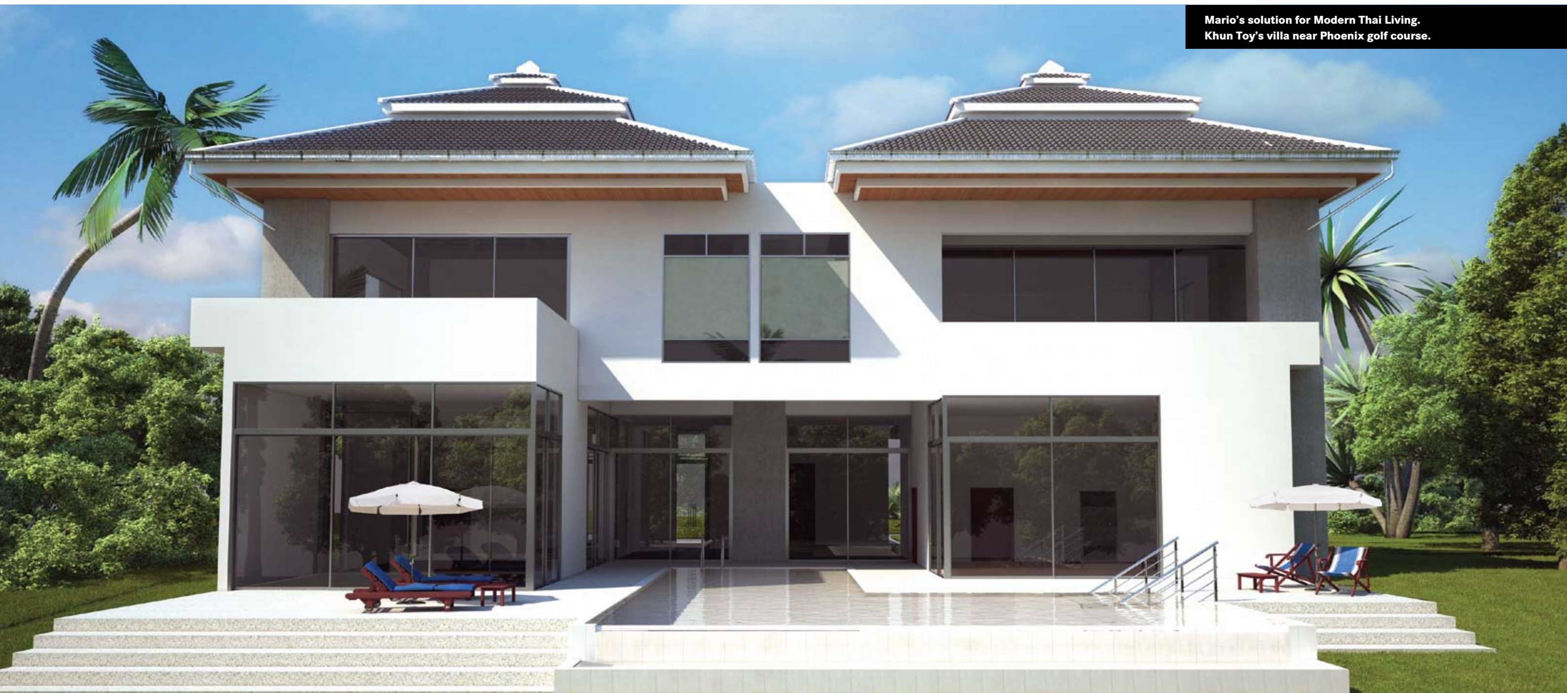
Mario’s solution for Modern Thai Living. Khun Toy’s villa near Phoenix golf course.

After all, it’s just one more boundary to exceed. Ω