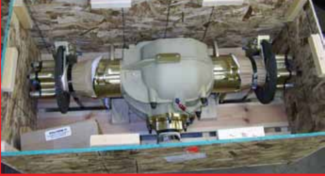
Every thing uniquely made