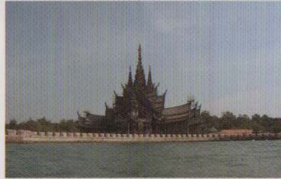
Naklua Soi 12, Wong Amat, North Pattaya